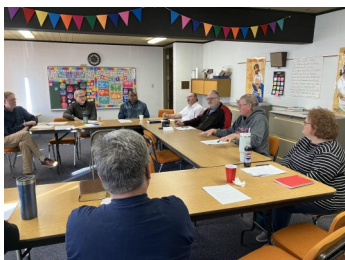
Clergy discuss the Mission statement of the Church